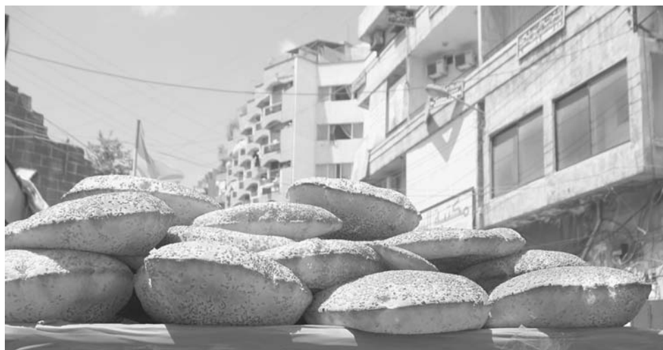
A street vendor's cart containing Kaak, a raised flatbread like pita. Kaak is the great street food of Lebanon.

Depending on the season, you can buy a bag of green almonds in the spring, a punnet of mulberries in the summer, or prickly pears that the vendor peels for the